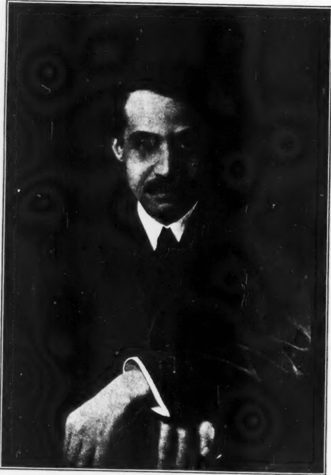
William Stanley Braithwaite r.